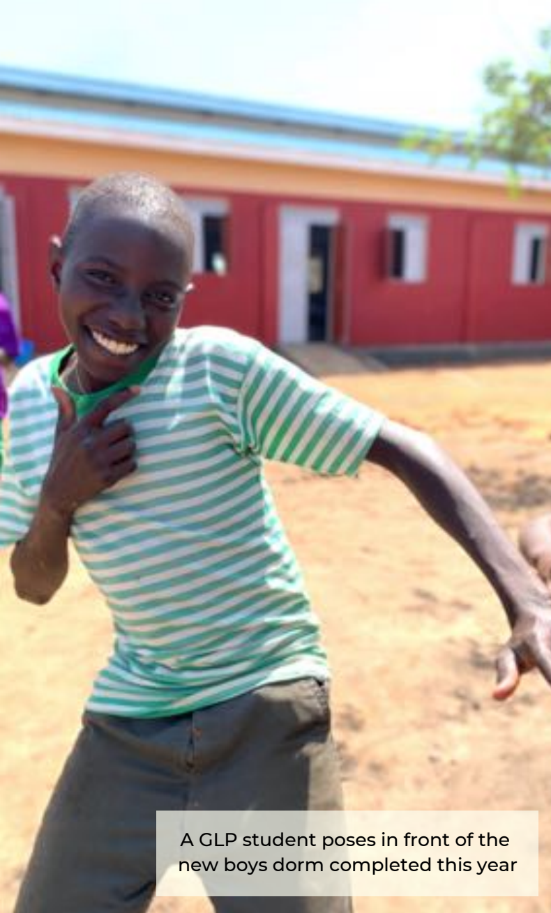
A GLP student poses in front of the new boys dorm completed this year